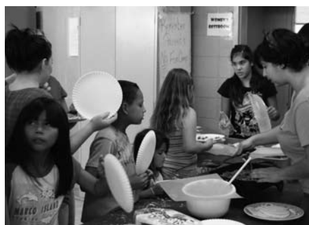
Romain neighborhood kids enjoy a weekly healthy cooking class.

According to the Fresno Police Department arrest records from 2009-2010, an average of 52 juvenile arrests were made in the neighborhoods immediately surrounding Holmes and Romain, as compared to an average of only six in the larger surrounding areas.