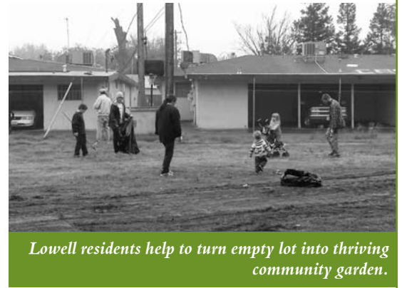
Lowell residents help to turn empty lot into thriving community garden.

Fresno Metro Ministry and the City of Fresno have begun the construction of another community garden. The garden will be located in the Lowell District at the intersection of Belmont and Poplar, across from the recently built San Pablo Family Park.