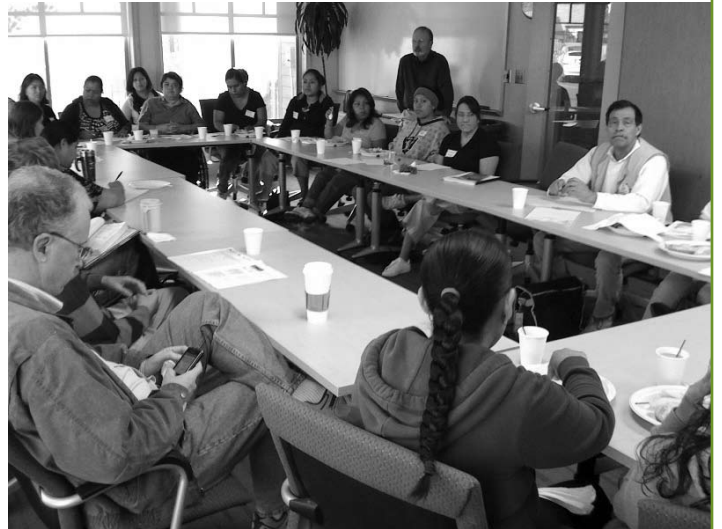
Community residents engage in leadership building training at Dickey Youth Center.

So it's important to have input on the plans before they are adopted. And equally important to monitor those plans over time to assure that specific improvements slated for our neighborhoods have the resources and the City's commitment to bring them about. That is how a bus stop gets an overhead